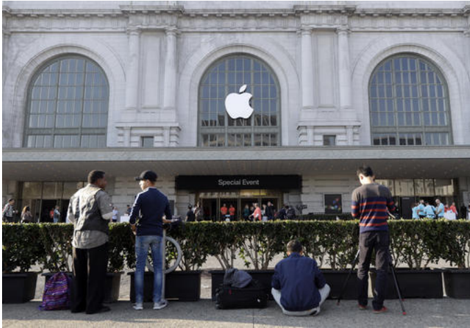
People wait to enter the auditorium before an event to announce new Apple products, Wednesday, Sept. 7, 2016, in San Francisco.