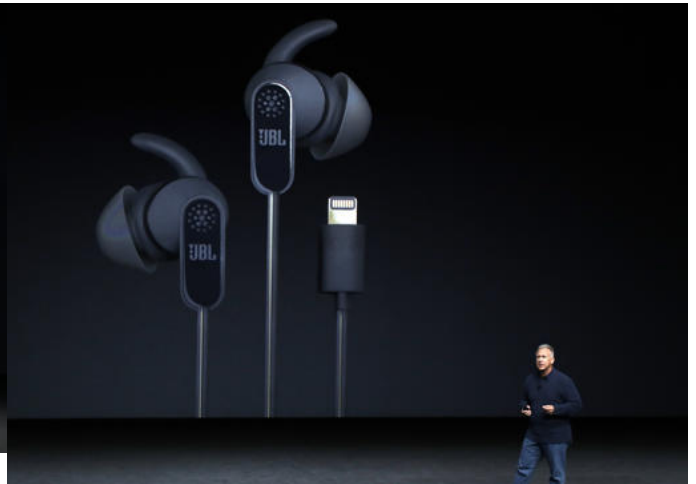
Phil Schiller, Apple's senior vice president of worldwide marketing, talks about the features on the new iPhone 7 earphone options during an event to announce new products Wednesday, Sept. 7, 2016, in San Francisco.