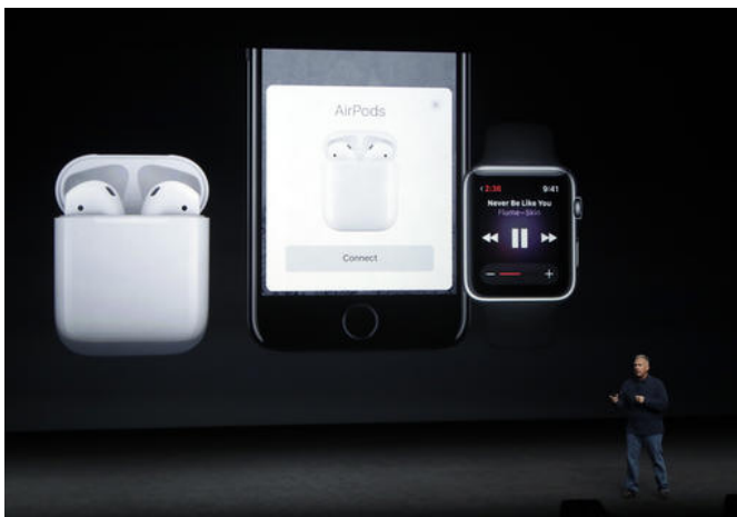
Phil Schiller, Apple's senior vice president of worldwide marketing, talks about the features on the new iPhone 7 earphone options during an event to announce new products Wednesday, Sept. 7, 2016, in San Francisco.