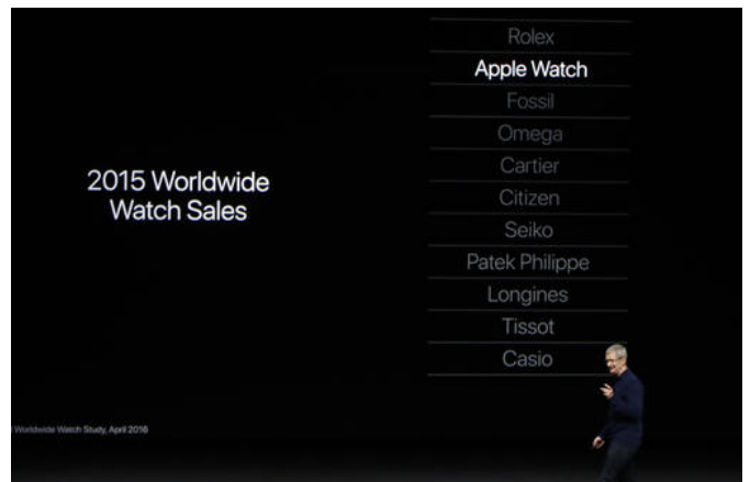
Apple CEO Tim Cook speaks during an event to announce new products on Wednesday, Sept. 7, 2016, in San Francisco.