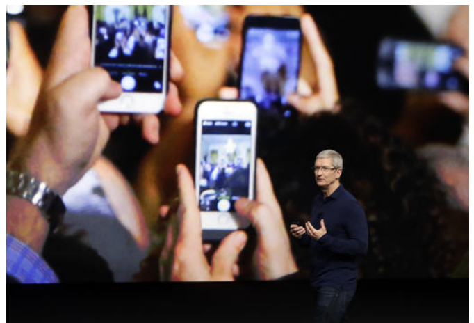
Apple CEO Tim Cook announces the new iPhone 7 during an event to announce new products Wednesday, Sept. 7, 2016, in San Francisco.