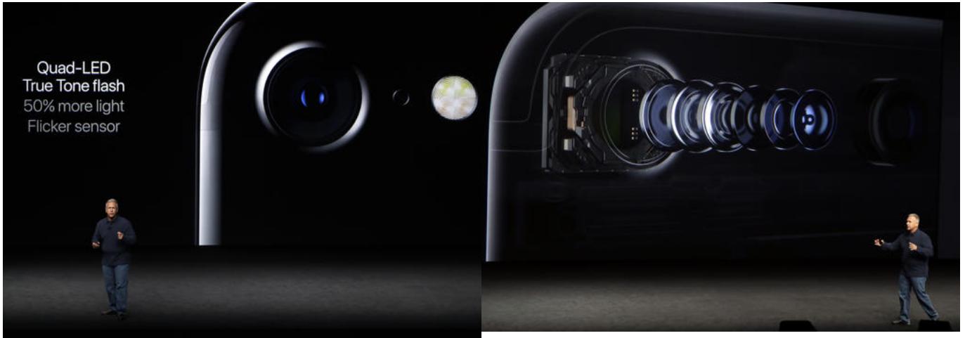
Phil Schiller, Apple's senior vice president of worldwide marketing, talks about the features on the new iPhone 7 during an event to announce new products, Wednesday, Sept. 7, 2016, in San Francisco.