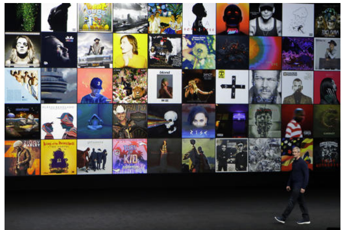
Apple CEO Tim Cook speaks during an event to announce new products on Wednesday, Sept. 7, 2016, in San Francisco.