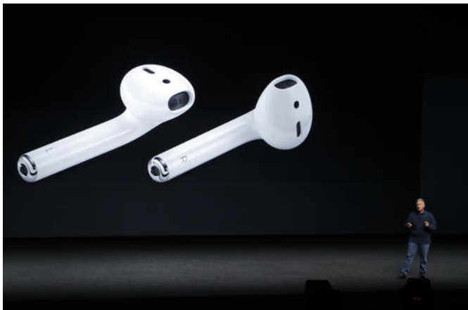
Phil Schiller, Apple's senior vice president of worldwide marketing, talks about the features on the new iPhone 7 earphone options during an event to announce new products, Wednesday, Sept. 7, 2016, in San Francisco.

The result allows a "seamless connection between you and your devices," said Apple chief design officer Jony Ive in a promotional video. "We're just at the beginning of a truly wireless future we've been working towards for many years."