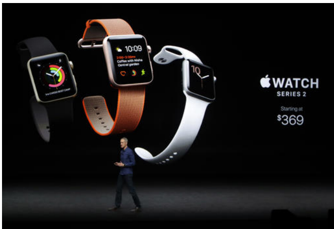
Jeff Williams, Apple's chief operating officer, speaks during an event to announce new products on Wednesday, Sept. 7, 2016, in San Francisco.