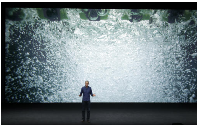
Jeff Williams, Apple's chief operating officer, speaks during an event to announce new products on Wednesday, Sept. 7, 2016, in San Francisco.