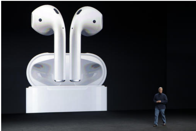
Phil Schiller, Apple's senior vice president of worldwide marketing, talks about the features on the new iPhone 7 earphone options during an event to announce new products Wednesday, Sept. 7, 2016, in San Francisco.