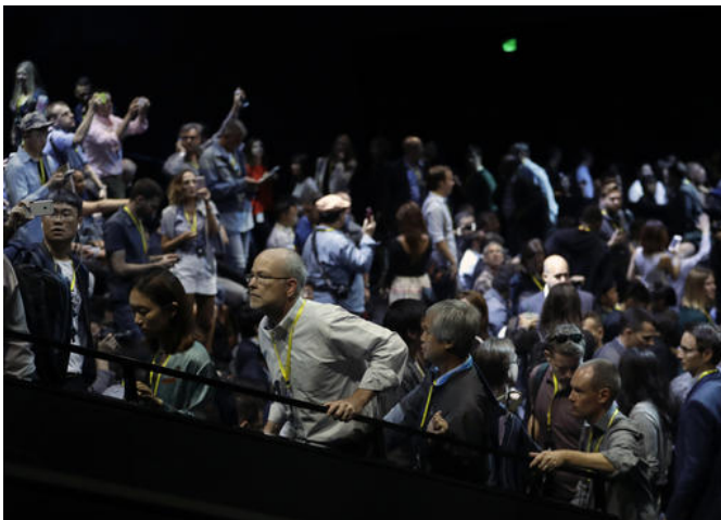
People enter the auditorium before an event to announce new Apple products, Wednesday, Sept. 7, 2016, in San Francisco.