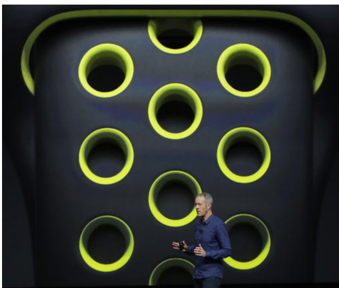
Jeff Williams, Apple's chief operating officer, speaks during an event to announce new products on Wednesday, Sept. 7, 2016, in San Francisco.