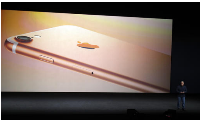
Phil Schiller, Apple's senior vice president of worldwide marketing, talks about the features on the new iPhone 7 during an event to announce new products Wednesday, Sept. 7, 2016, in San Francisco.