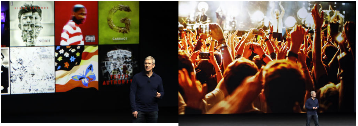
Apple CEO Tim Cook speaks during an event to announce new products on Wednesday, Sept. 7, 2016, in San Francisco.