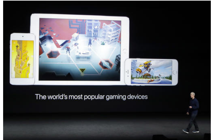
Apple CEO Tim Cook speaks during an event to announce new products on Wednesday, Sept. 7, 2016, in San Francisco.