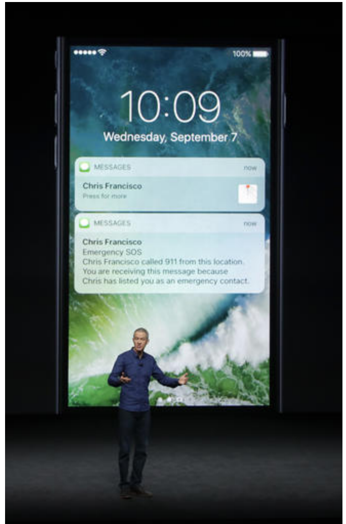
Jeff Williams, Apple's chief operating officer, speaks during an event to announce new products on Wednesday, Sept. 7, 2016, in San Francisco.