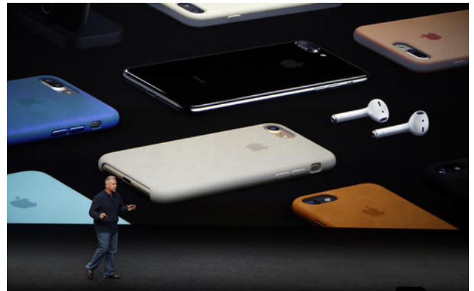
Phil Schiller, Apple's senior vice president of worldwide marketing, talks about the pricing on the new iPhone 7 during an event to announce new products Wednesday, Sept. 7, 2016, in San Francisco.