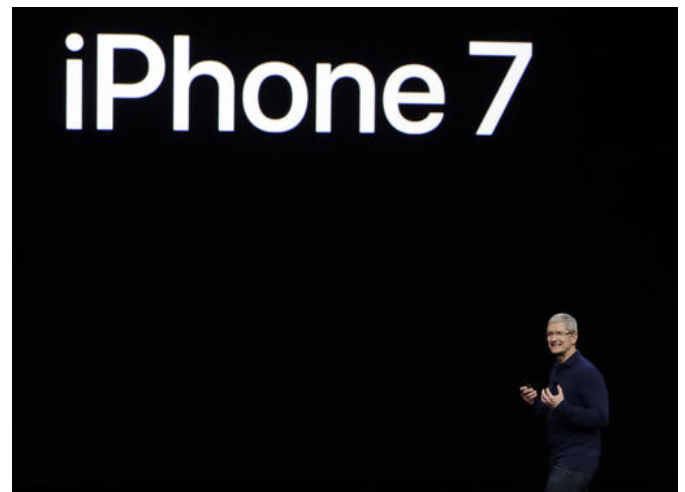
Apple CEO Tim Cook announces the new iPhone 7 during an event to announce new products Wednesday, Sept. 7, 2016, in San Francisco.