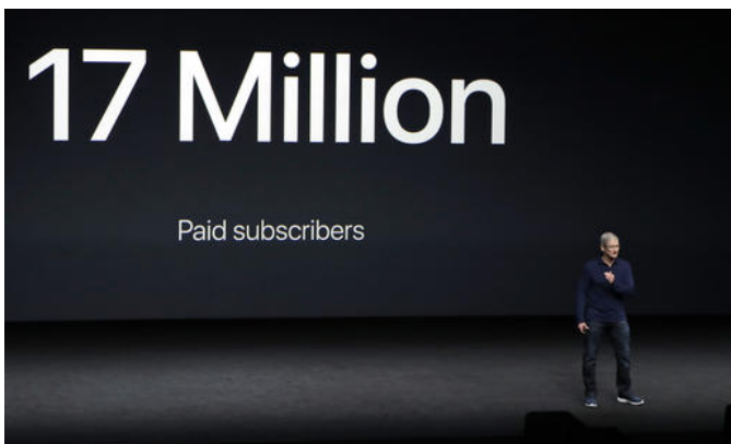
Apple CEO Tim Cook speaks during an event to announce new products, Wednesday, Sept. 7, 2016, in San Francisco.