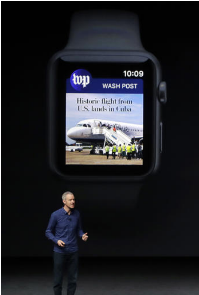
Jeff Williams, Apple's chief operating officer, speaks during an event to announce new products on Wednesday, Sept. 7, 2016, in San Francisco.