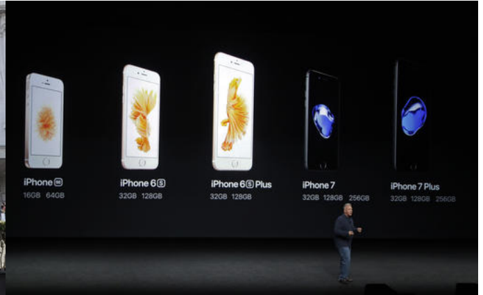
Phil Schiller, Apple's senior vice president of worldwide marketing, talks about Apple's iPhone lineup during an event to announce new products, Wednesday, Sept. 7, 2016, in San Francisco.