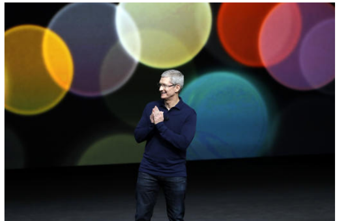
Apple CEO Tim Cook speaks during an event to announce new products on Wednesday, Sept. 7, 2016, in San Francisco.