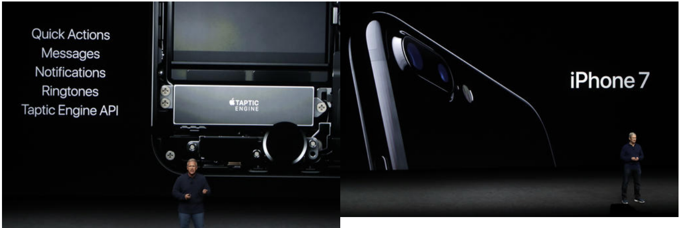
Phil Schiller, Apple's senior vice president of worldwide marketing, talks about the features on the new iPhone 7 during an event to announce new products Wednesday, Sept. 7, 2016, in San Francisco.