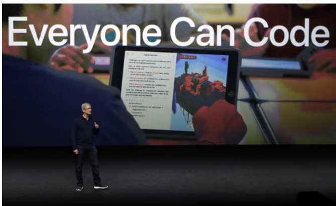
Apple CEO Tim Cook speaks during an event to announce new products on Wednesday, Sept. 7, 2016, in San Francisco.