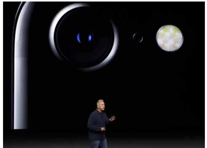
Phil Schiller, Apple's senior vice president of worldwide marketing, talks about the features on the new iPhone 7 during an event to announce new products, Wednesday, Sept. 7, 2016, in San Francisco.