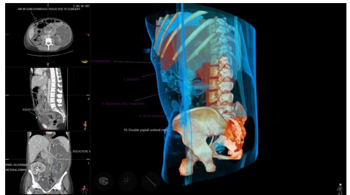
Kidney transplant on the virtual anatomy table.