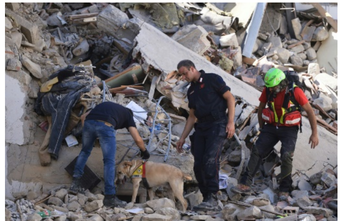
Firemen and rescuers search destroyed buildings in Amatrice, central Italy following the quake early on August 24, 2016

Rescuers carry the body of a victim away from the rubble of buildings in Amatrice, central Italy following the earthquake