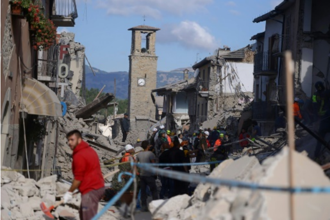
Rescuers and firemen search the rubble of buildings in Amatrice, central Italy on August 24, 2016 following the earthquake that struck before dawn

The deadly earthquake that struck central Italy before dawn Wednesday occurred in a notorious seismic hotspot, and dangerous aftershocks are possible, scientists said.