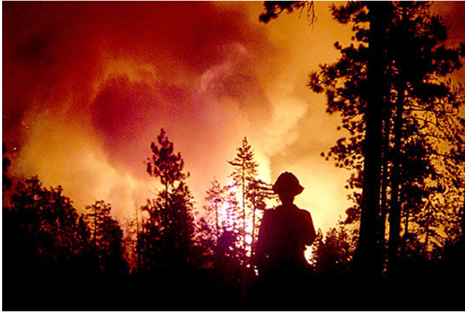
Firefighters are currently battling dozens of fires in at least 11 states.

Research by environmental scientists at the Harvard School of Engineering and Applied Sciences (SEAS) brings bad news to the western United States, where firefighters are currently battling dozens of fires in at least 11 states.