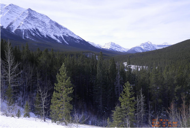
A present day view north in the area where the retreating ice sheets created the ice free corridor more than 13,000 years ago.