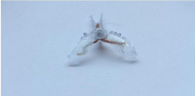
Biohybrid sea slug, reporting for duty. Credit: Dr. Andrew Horchler, CC BY-ND

Think of a traditional robot and you probably imagine something made from metal and plastic. Such "nuts-and-bolts" robots are made of hard materials. As robots take on more roles beyond the lab, such rigid systems can present safety risks to the people they interact with. For example, if an industrial robot swings into a person, there is the risk of bruises or bone damage.