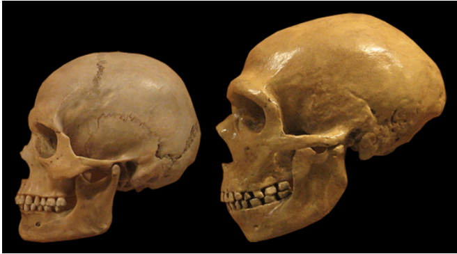
Comparison of Modern Human and Neanderthal skulls from the Cleveland Museum of Natural History.