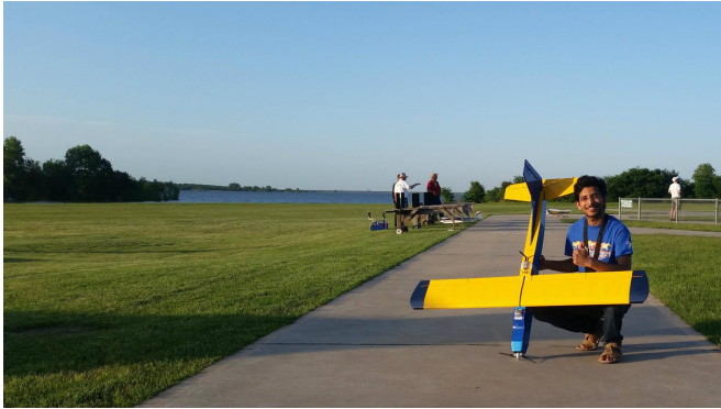
Sampath Vengate.

A recently graduated University of Texas at Arlington student is the first person to successfully flight test an unmanned aerial vehicle that uses moving weights in its wings instead of traditional control surfaces or ailerons to turn.