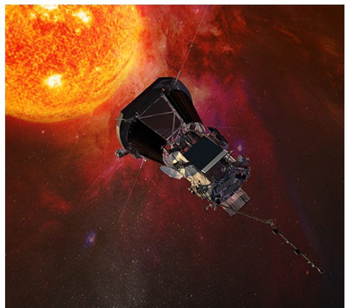
Artist's impression of the Solar Probe Plus spacecraft.

Solar Probe Plus is set to launch during a 20-day window that opens July 31, 2018. Over 24 orbits, the spacecraft will use seven flybys of Venus to reduce its distance from the sun. The closest three orbits will be within 3.9 million miles of the sun's surface—roughly seven times closer than any spacecraft has come to our star—where it will face solar intensity more than 500 times what spacecraft experience while orbiting Earth.