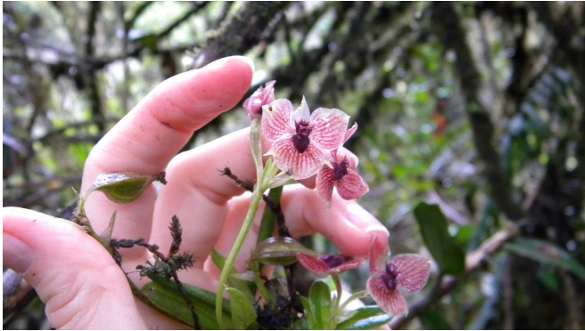
New orchid species Telipogon diabolicus .

A lone and unique population of about 30 reddish to dark violet-maroon orchids grows on the small patch of land between the borders of two Colombian departments. However, its extremely small habitat is far from the only striking thing about the new species.