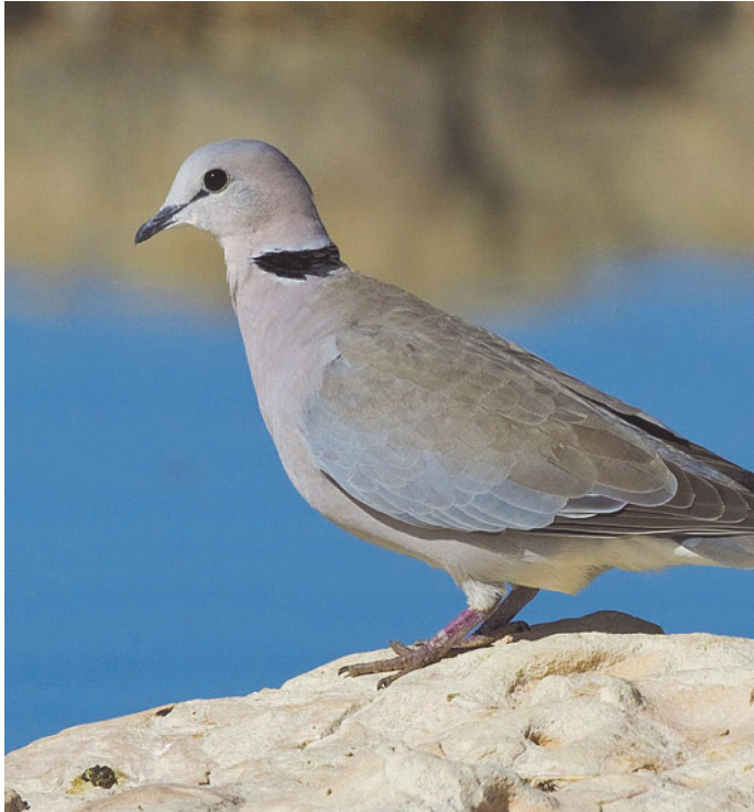
A dove's coo is an example of a closed-mouth vocalization.