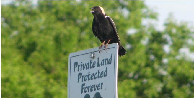
Bobolink on a Mississippi Valley Conservancy sign.

The Cornell Lab of Ornithology and the Land Trust Alliance are partnering to help protect birds on private lands. The goal of the new Land Trust Bird Conservation Initiative and associated website is to improve conservation for declining species by pairing the bird conservation community with land trusts, which collectively protect more than 24 million acres of private land nationwide.