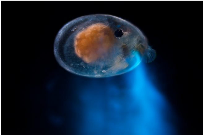
A bioluminescent ostracod of the family Cypridinidae.

biodiversity and evolutionary history across many different animals that use bioluminescent courtship, including fireflies, fishes and octopuses. They found 10 groups in which a bioluminescent courting species outnumbered its sister clade, the scientific term for its nearest relatives or immediate family.