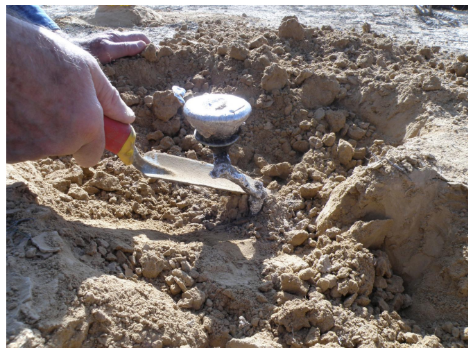
The researchers dig out a metal cast of a burrow made by a scorpion, Scorpio palmatus, in the Negev desert in Israel.