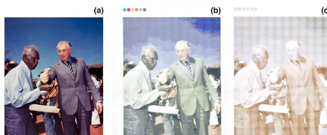
(a) A 1.5-cm-long image produced by plasmonic pixels. This photograph was taken in 1975 by Mervyn Bishop of Australian Prime Minister Gough Whitlam pouring sand into the hand of the leader of the Gurindji communities, Vincent Lingiari, symbolically handing the Wave Hill station back to the Gurindji people. (b) Image taken with polarizer aligned to x-axis. (c) Image taken with polarizer aligned to y-axis.

"The potential applications for the plasmonic pixel (and other color-producing nanostructures in this research space) would be as an industrial paint on cars, buildings, advertising billboards, etc., as the plasmonic pixels will never fade," James told Phys.org . "With the ability to print at resolutions greater than conventional pigment-based processes, the plasmonic pixels may also have applications in security-based devices for use on high-value product packaging, medicines, etc."