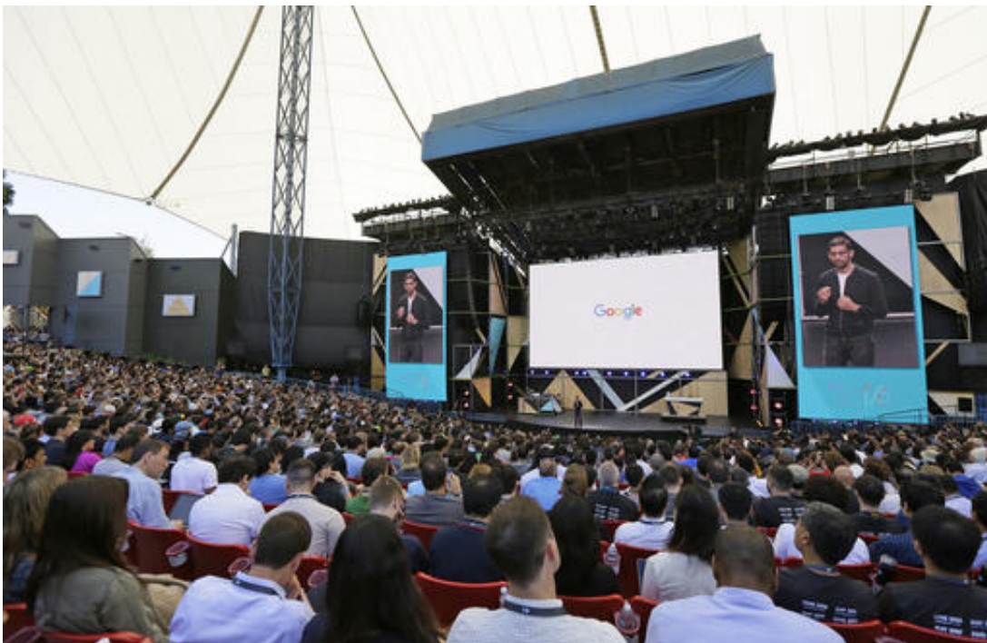
Google CEO Sundar Pichai gives closing remarks at the end of the keynote address of the Google I/O conference, Wednesday, May 18, 2016, in Mountain View, Calif.