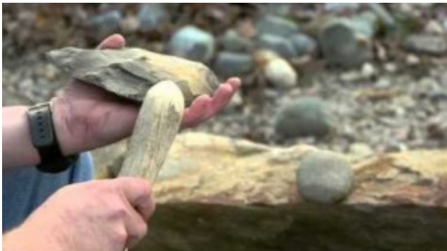
A researcher demonstrates the technique behind making stone tools. Although it appears simple, research shows that language is critical when passing on these skills.

Given their adaptation to cold climates and their advanced, albeit under-appreciated, skills, how were Neanderthals beaten out by their human counterparts? The answer lies in a combination of culture and genetics that enabled the successful radiation of humans.