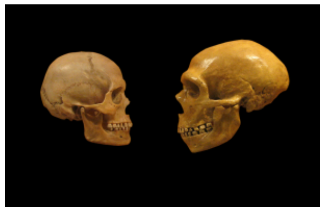
A human skull on the left, versus a Neanderthal skull on the right.