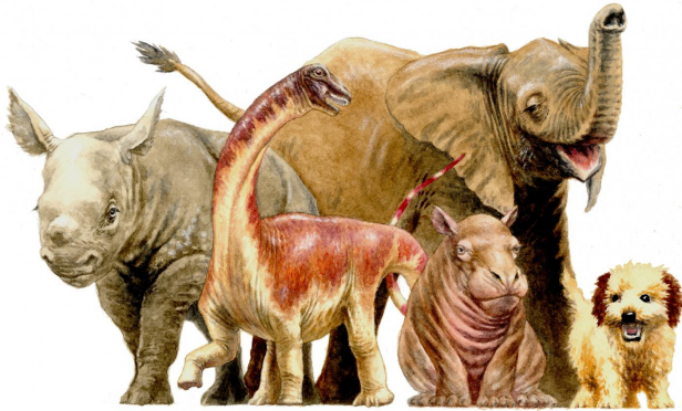
A baby Rapetosaurus stands alongside other young mammals of today for size comparison. Credit: Demetrios Vital

Long-necked sauropod dinosaurs include the largest animals ever to walk on land, but they hatched from eggs no bigger than a soccer ball.