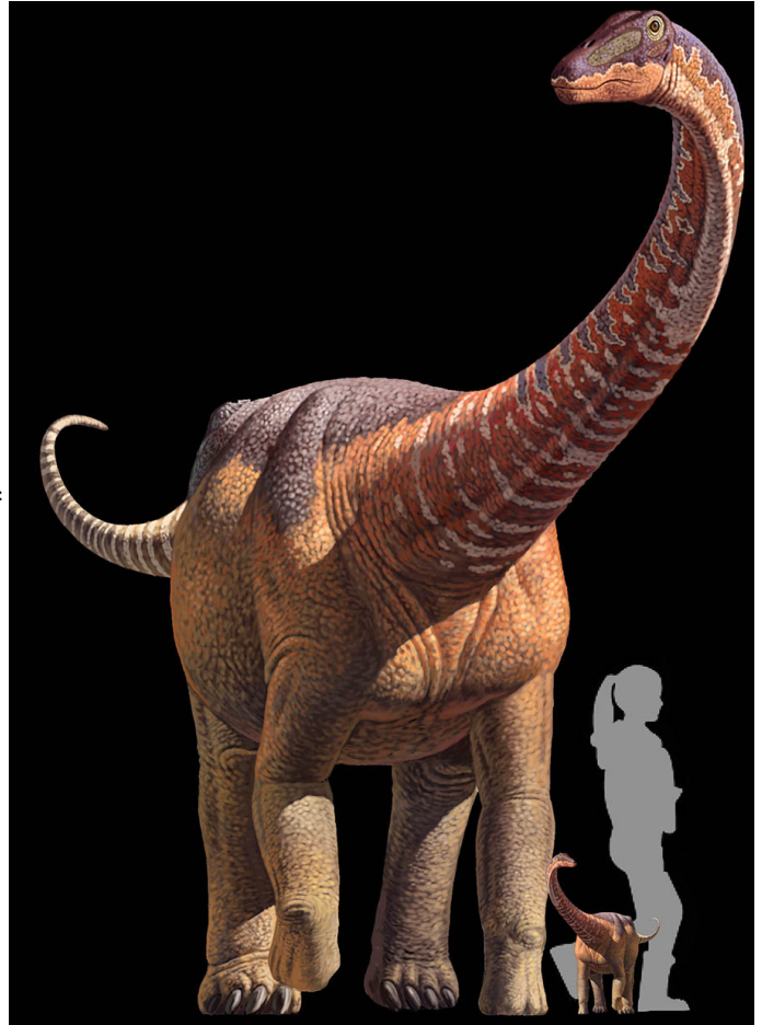
A comparison of an adult Rapetosaurus , a baby Rapetosaurus and a human. Credit: Kristi Curry Rogers

The detailed microscopic features of the Rapetosaurus bones revealed patterns similar to those of living animals and made it possible for the scientists to reconstruct the beginning of the dinosaur's post-hatching life.