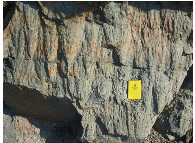
Shatter cones (pyramid-like structures) formed from the shock wave of the impact, and can be seen as that wave migrated through the rock from the bottom up.

Ten years ago, a team of researchers in the US 1 argued that the ancient zircon crystals probably formed when tectonic plates moving around on the Earth's surface collided with each other in a similar fashion to the disruption taking place in the Andes Mountains today, where the ocean floor under the Pacific Ocean is plunging under South America.