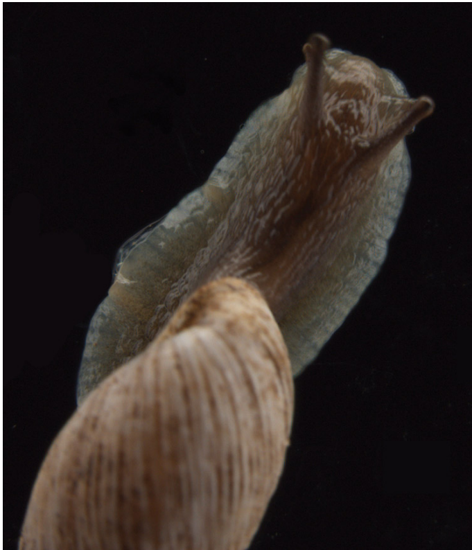
Living land snail of the new species Bothriembryon (B.) sophiarum.