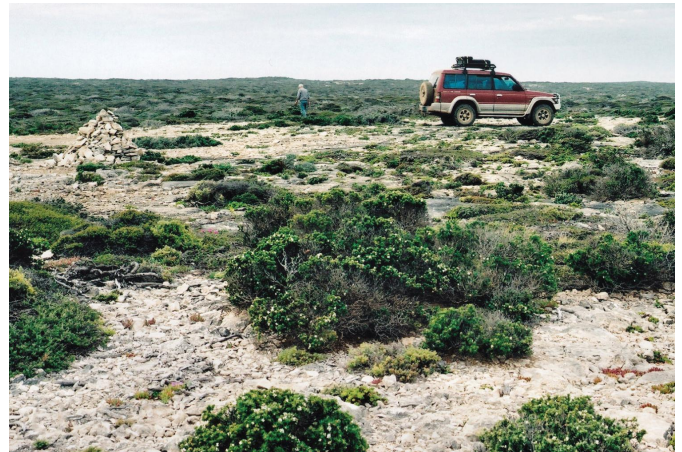
Habitat of the newly described new land snail species Bothriembryon (B.) sophiarum.