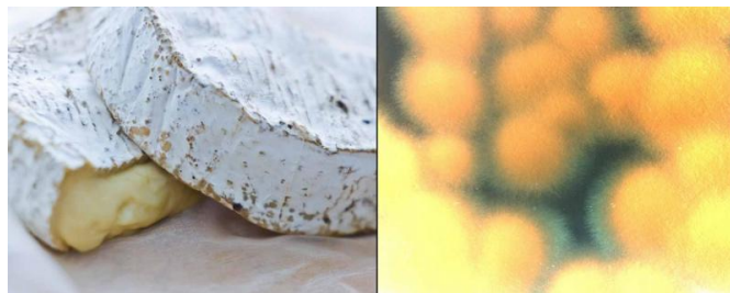
Penicillium camemberti is the white mold found on Brie and Camembert and produces mushroom-like flavors as it breaks down the protein in cheese.