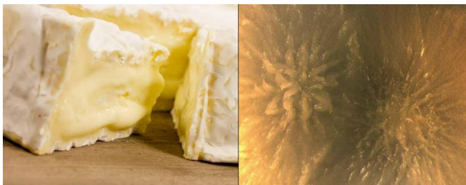
Geotrichum candidum is a yeast species that produces cauliflower-like aromas in Camembert and Brie.