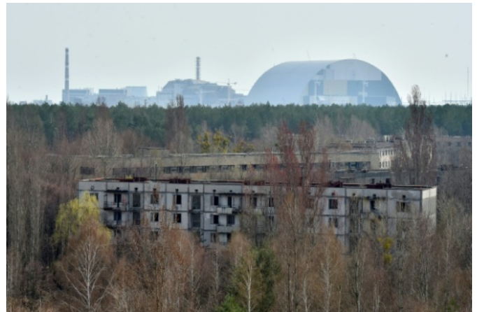
The Chernobyl nuclear power plant is seen in the distance from the ghost city of Prypyat on April 8, 2016

But any belief that enough had been done was swamped by the tsunami that knocked out the power supply and cooling systems of three reactors at the Fukushima Daiichi nuclear plant on March 11, 2011.