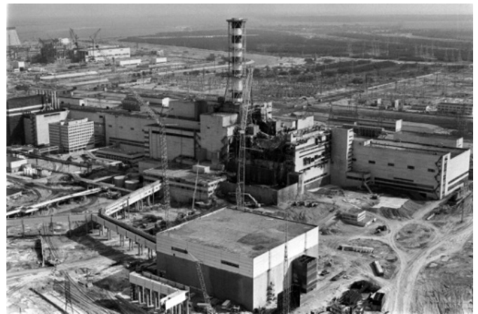
A general view taken from a helicopter in April 1986 shows the destroyed fourth power block of Chernobyl's nuclear power plant few days after the nuclear catastrophe

The first alarm was raised on April 28, 1986, not by Russia but by Sweden after it detected an unexplained rise in radiation levels. Soviet leader Mikhail Gorbachev did not admit the disaster had occurred until May 14.