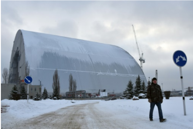
A man walks past the Chernobyl New Safe Confinement structure (NSC) under construction in Chernobyl, Ukraine on January 22, 2016

Ukraine next week marks the 30th anniversary of the Chernobyl disaster, when human error and flawed Soviet reactor technology led to the world's worst nuclear accident.