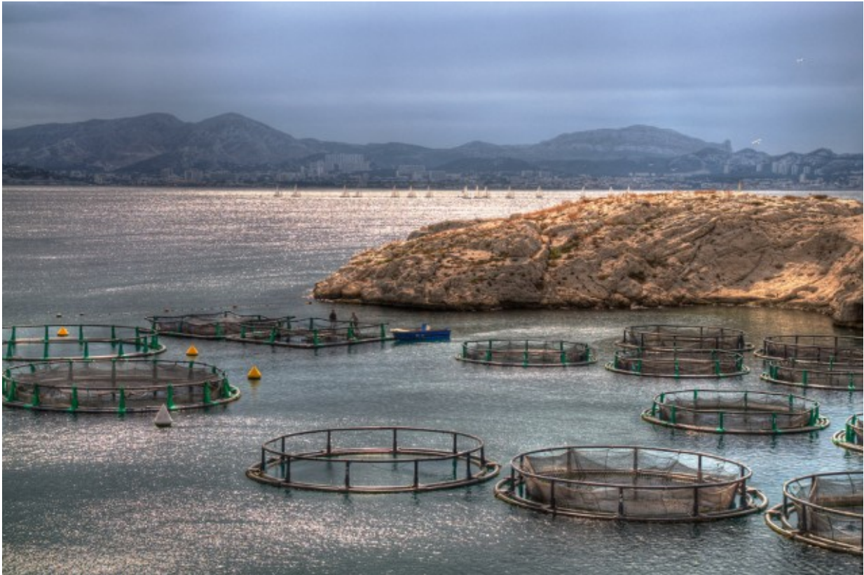
Fish farming in Marseille, France.