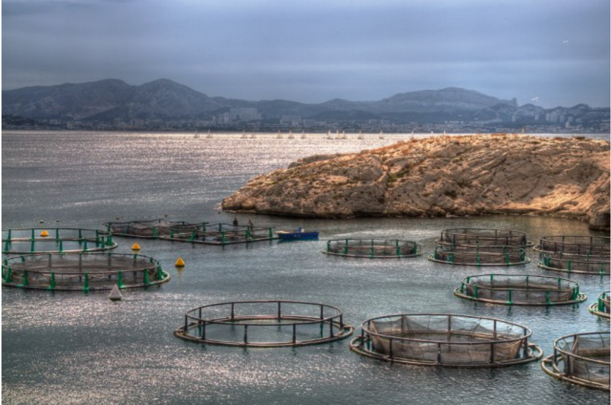
Fish farming in Marseille, France.