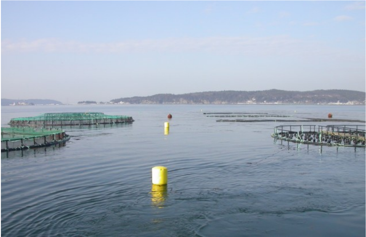
An Integrated Multi-Trophic Aquaculture site at Cooke Aquaculture Inc. in the Bay of Fundy, Canada: salmon cages (left), mussel raft (right foreground) and seaweed raft (right background).

A Dutch and Vietnamese industry group along with universities and research organizations is designing a "nutritious-system" concept of aquaculture in Vietnam that utilizes the natural ecosystem of a pond to farm fish or shrimp and get rid of the waste. The project studies how omega-3 fatty acids are produced and will determine the right balance of algae and bacteria to ensure the best water quality, nutrition for fish and shrimp, and decomposition of waste.