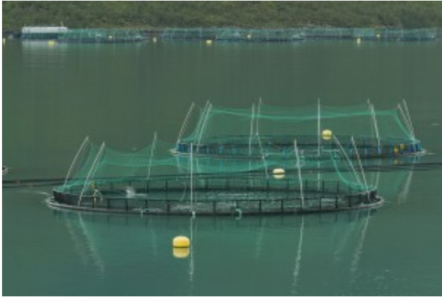
Aquaculture in Norway.

This is one reason that aquaculture has a reputation as being unsustainable. In 1997, it took almost 3 tons of forage fish to produce one ton of salmon. A third of the global fish harvest still goes toward making fish meal and fish oil. As a result, forage fish are being overfished, and some populations have crashed, which has implications for the entire food web since larger fish depend on them for food.