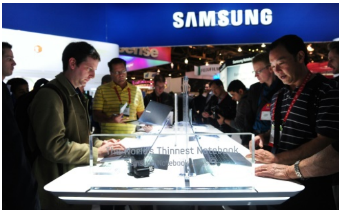
Visitors check out Samsung's laptop computers during the International Consumer Electronics Show in Las Vegas, Nevada

quarter at 49 trillion won, up from 47.1 trillion won a year before.