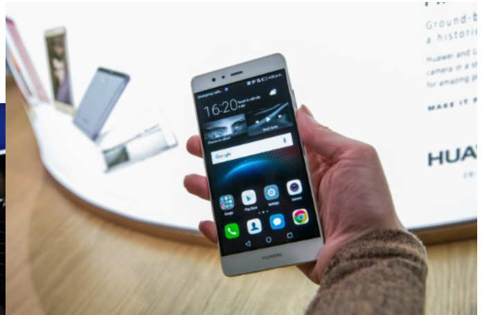
Samsung is to face a fresh challenge following the launch of Huawei's P9 smartphone (pictured), the Chinese maker's first foray into the high-end segment of the market where it hopes to take on the iPhone and Galaxy S handsets

Thursday's forecast, which comes ahead of audited results to be released this month, did not provide a net income figure or breakdown of divisional earnings for the company's mobile, TV, semiconductor and display units.