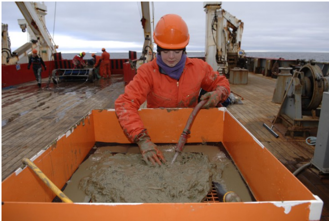
Sieving sediment from the seabed for animals

Research published this week by an international team of scientists, including the British Antarctic Survey, provides new insights into how carbon dioxide changed in the oceans surrounding Antarctica during glacial periods.