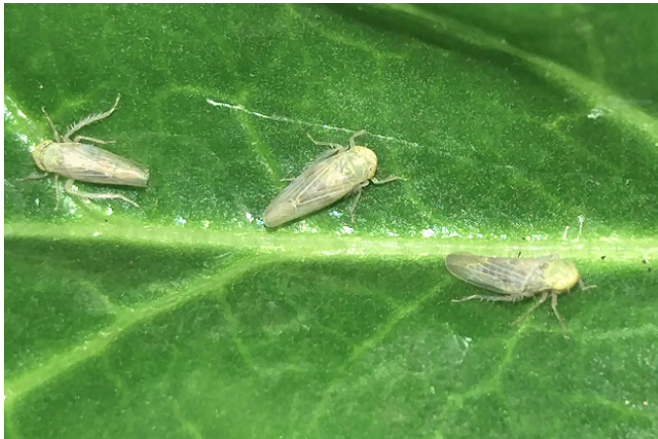
Beet leafhoppers can transmit curly top virus as they feed on plant leaves.

The sugar beet curly top virus could meet its match in new sugar beet varieties derived from KDH13, a germplasm breeding line developed by Agricultural Research Service (ARS) researchers for resistance to the disease-causing pathogen.