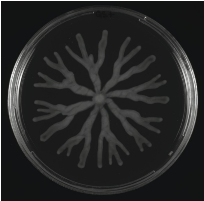
P. aeruginosa need iron-limitation and QS to swarm.

The choice of whether to cooperate or not is dependent on more than just surrounding community composition, however. A PLOS Computational Biology paper demonstrates that the bacterium Pseudomonas aeruginosa integrates information about both population size and metabolic resources to make the decision on whether to put energy into costly cooperative behaviors. Intriguingly, they found that limiting carbon source, nitrogen source, or iron each affected the production of the public good, rhamnolipids, differently, indicating a sophisticated consideration of both QS and nutrient signals.