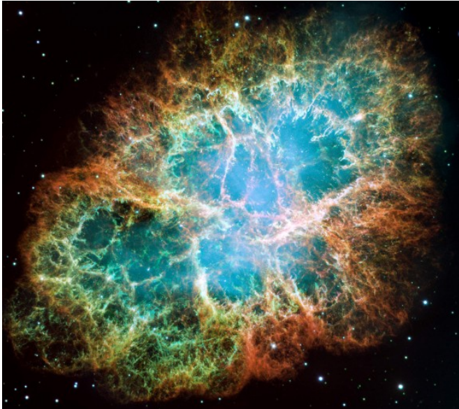
Our eyes would never see the Crab Nebula as this Hubble image shows it.

There are a few places in the universe that defy comprehension. And supernovae have got to be the most extreme places you can imagine. We're talking about a star with potentially dozens of times the size and mass of our own sun that violently dies in a fraction of a second.