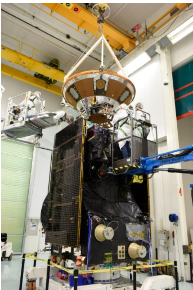
Picture released by the European Space Agency (ESA) shows technicians working on the final preparations on one of two ExoMars spacecraft

TGO will analyse Mars' methane in more detail than any previous mission, said ESA, to try and determine its likely origin.