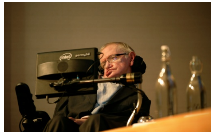
Professor Stephen Hawking is among the leading voices of caution regarding artificial intelligence