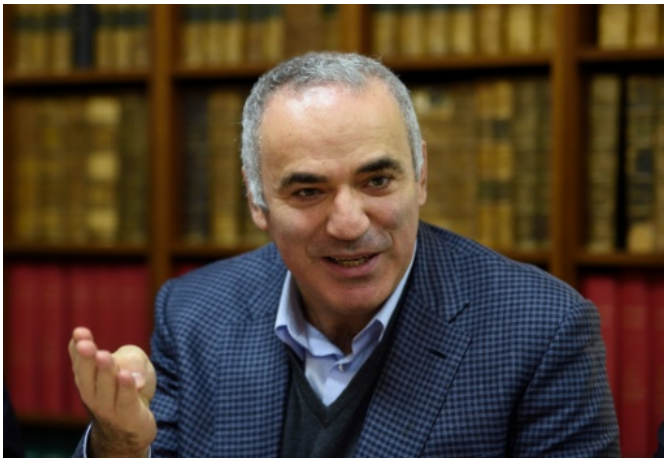
IBM's Deep Blue defeated Russian chess Grandmaster Garry Kasparov in 1997

It is partly self-taught—having played millions of games against itself after initial programming to hone its tactics through trial and error.