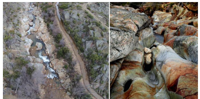
The Cantabrian orocline is a large structure that bends the Variscan orogen of Western Europe in NW Iberia.

After analyzing the samples in a palaeomagnetism lab at Utrecht University (The Netherlands), they have reconstructed the history of these ancient rocks based on the magnetic signal of their mineral content. The results have been published in the journal Tectonophysics .