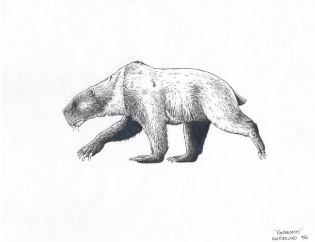
A full-body reconstruction of Kolponomos clallamensis . Credit: Illustrated by Ken Kirkland for the book "Neptune's Ark"

New research suggests that the feeding strategy of Kolponomos , an enigmatic shell-crushing marine predator that lived about 20 million years ago, was strangely similar to a very different kind of carnivore: the saber-toothed cat Smilodon . Scientists at the American Museum of Natural History used high-resolution x-ray imaging and computerized biting simulations to show that even though the two extinct predators likely contrasted greatly in food preference and environment, they shared similar engineering in jaw structure, suitable for anchoring against prey with the lower jaw and forcefully throwing the skull forward to pry loose its food. The study is published today in the journal Proceedings of the Royal Society B .