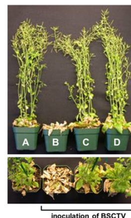
Figure 2: Creation of virus-resistant plants with AZP. Plant A is a healthy wild plant without virus infection. Inoculated BSCTV to plants B, C and D. Stem of the wild plant (Plant B) stopped growing and died 4 weeks after BSCTV inoculation. In contrast, AZP-transgenic plants (Plants C and D) showed complete virus resistance. In our AZP-transgenic plants with no symptoms, viral DNA was not detected at all by Southern blot analysis.

This approach prevents viral infection by inhibiting replication protein (Rep) from binding to its replication origin by using an artificial DNA-binding protein capable of binding strongly to a target DNA sequence. To demonstrate the effectiveness of this method, the researchers used Arabidopsis, an experimental plant, and beet severe curly top virus (BSCTV), a DNA virus. BSCTV was chosen because it is known to strongly infect and kill many plants including Arabidopsis.