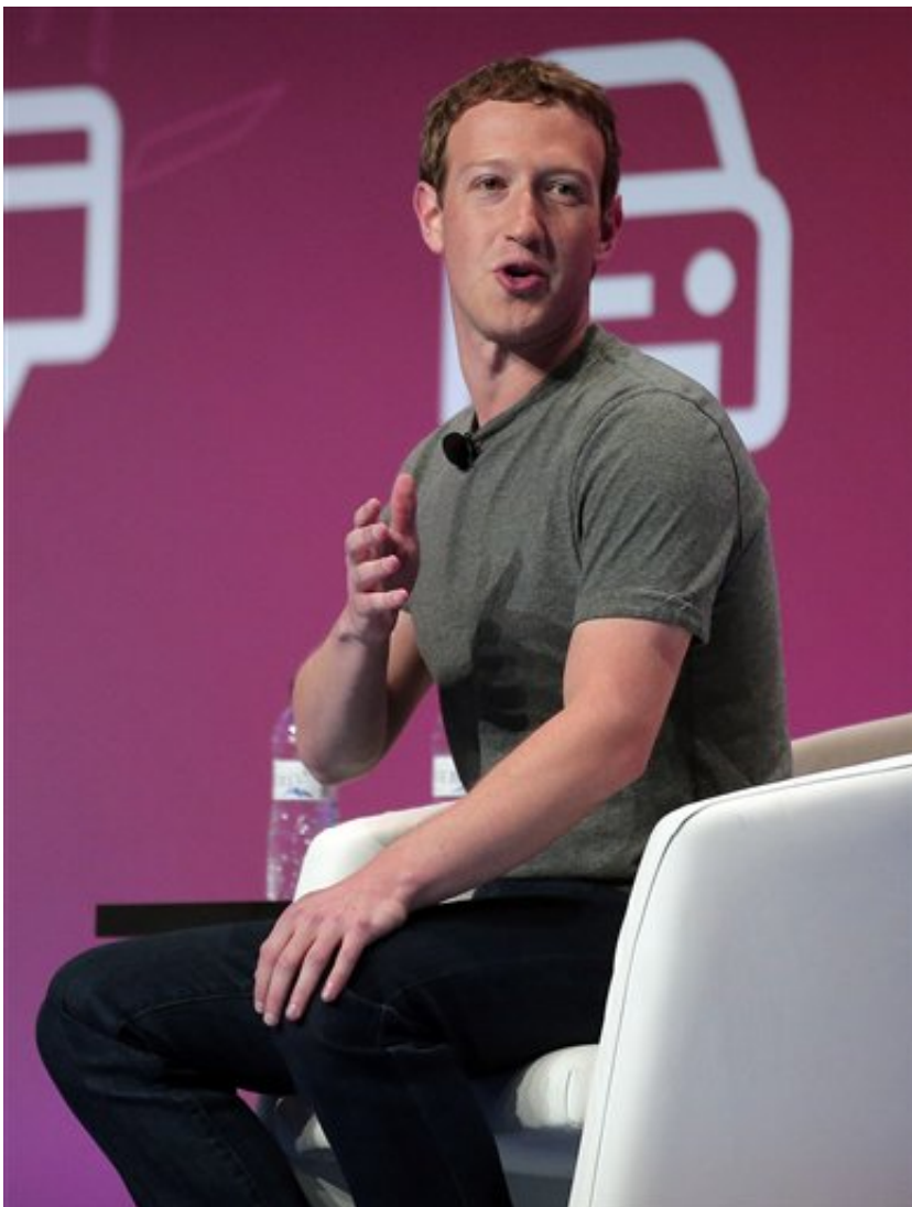
Facebook CEO Mark Zuckerberg gestures during a conference at the Mobile World Congress wireless show in Barcelona, Spain, Monday, Feb. 22, 2016.

Facebook responded last fall by announcing it would open Free Basics to any app that met its technical requirements for systems with limited capacity. Zuckerberg also changed the program's name to Free Basics, after critics complained "Internet.org" sounded like a nonprofit, when it's part of a for-profit company (the overall campaign is still called Internet.org).