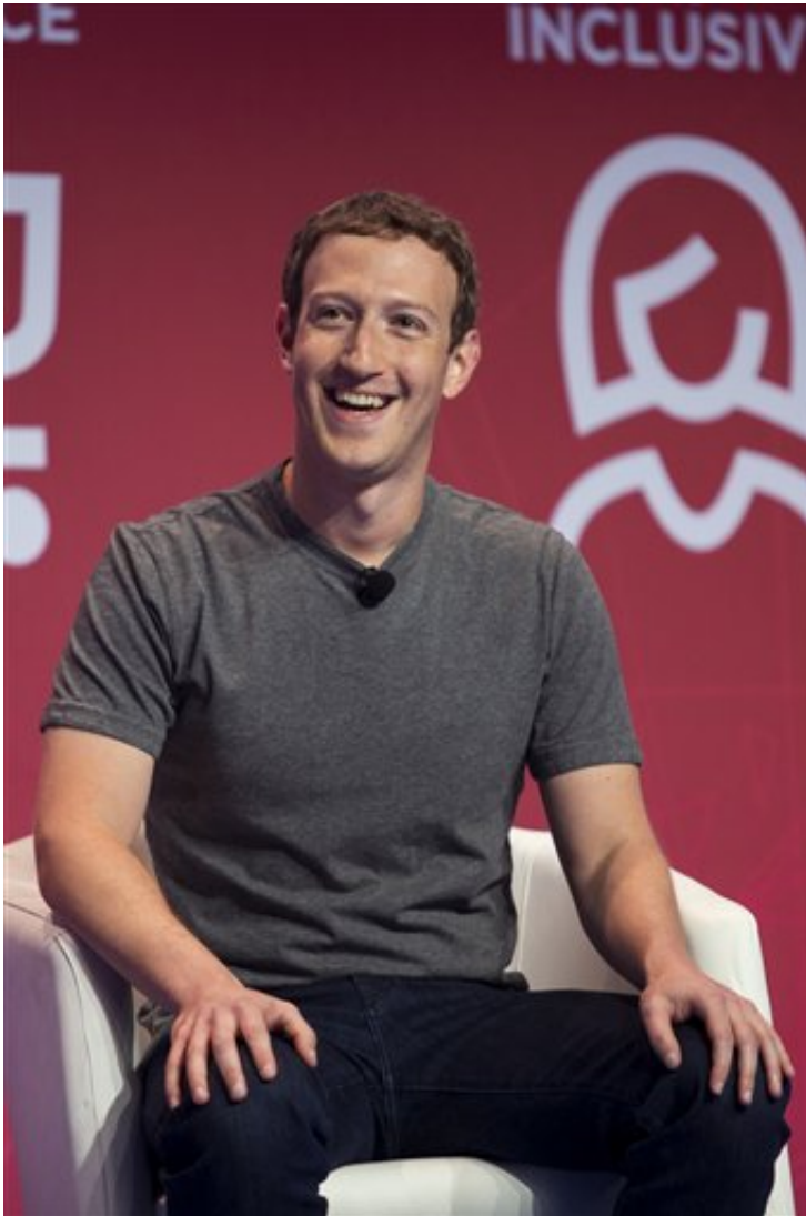
Facebook CEO Mark Zuckerberg smiles during his speech at the Mobile World Congress wireless show in Barcelona, Spain, Monday, Feb. 22, 2016.

© 2016 The Associated Press. All rights reserved.