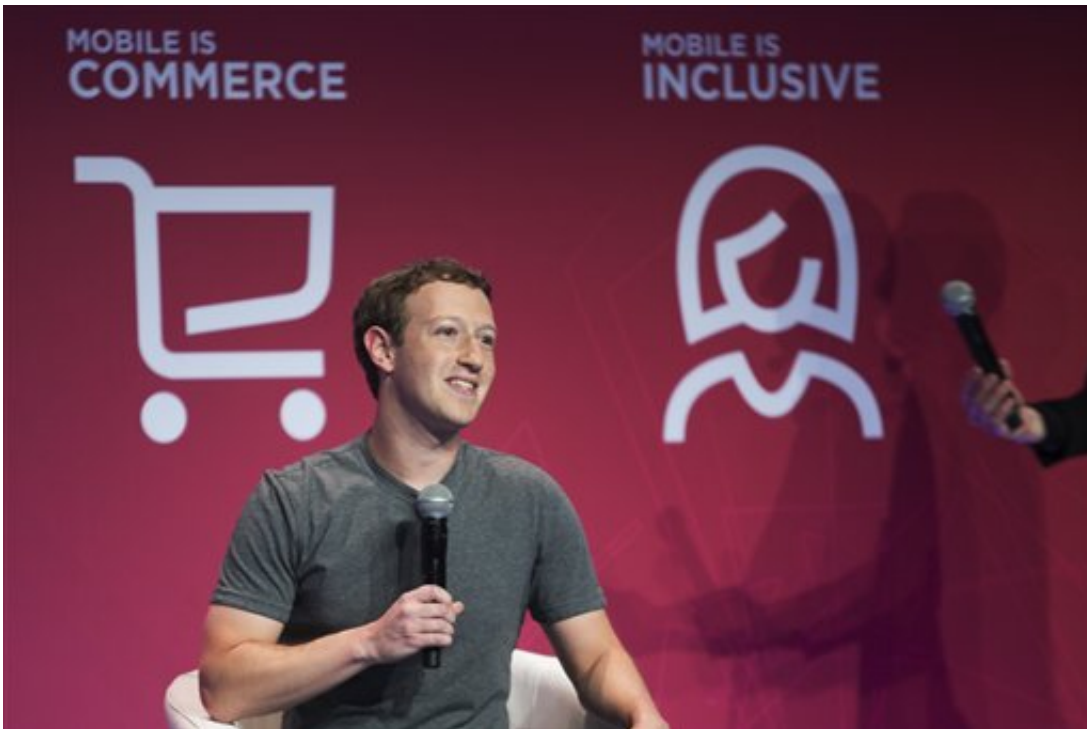
Facebook CEO Mark Zuckerberg talks during his speech at the Mobile World Congress Wireless show, the world's largest mobile phone trade show, in Barcelona, Spain, Monday, Feb. 22, 2016.

Last fall, Facebook announced a major expansion in Africa, where another regional carrier, Bharti Airtel, said it will offer Free Basics in 17 countries.