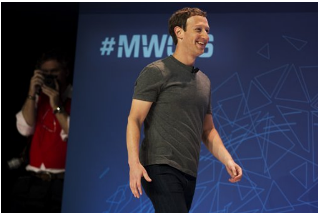
Facebook CEO Mark Zuckerberg walks on the stage before his speech at the

While the company hasn't released detailed usage figures, Facebook says Free Basics has brought more than 19 million people online for the first time. That counts any user who didn't have Internet access before, regardless of whether they're currently active.