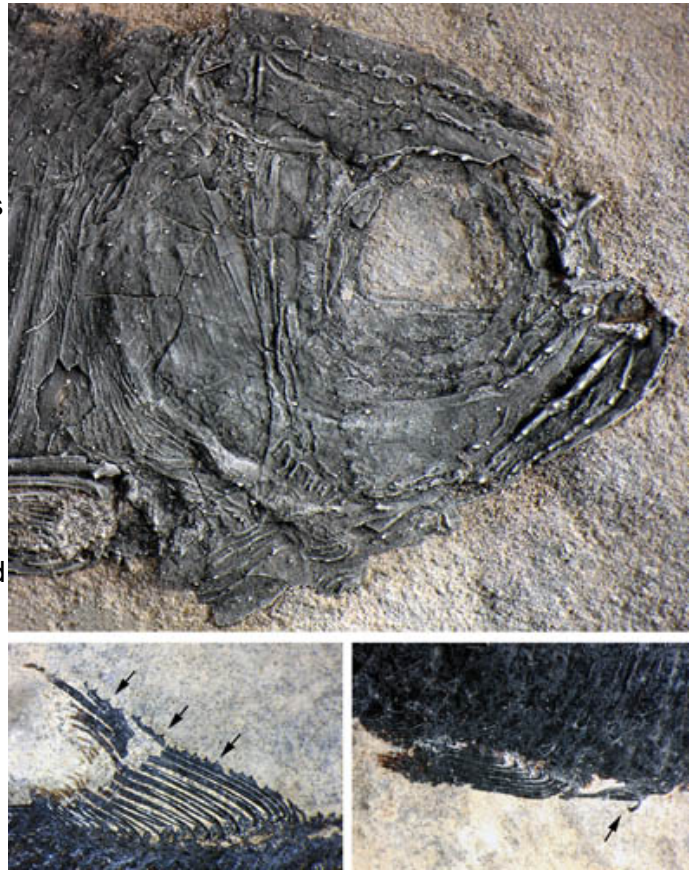
Fig.3 Secondary sexual characteristics on cranial bones, in dorsal fin with arrows indicating pointed tubercles along its leading ray, and anal fin with arrow indicating hook-like contact organ anterior to anal fin.

The living sexually dimorphic ray-finned fishes, including several families of cypriniform fishes and a few gonorynchiform and salmonoid fishes, bear breeding tubercles and contact organs on the head, scales and fins of the male that come in direct contact with the female during prespawning behavior or during the spawning, or that come into contact with other males during fights and defense of territories. Therefore, the secondary sexual characteristics of Venusichthys are similar in shape and distribution, to the breeding tubercles and contact organs of living sexually dimorphic ray-finned fishes, and consequently, they may have had similar functions.