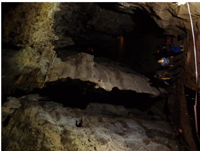
Researchers explore the Milner Hall in the Sterkfontein Caves for new fossils.

"In size and shape it also bears a resemblance to two of the 10 1st molars of the H. naledi specimens, although further and more detailed comparisons are needed to verify this."