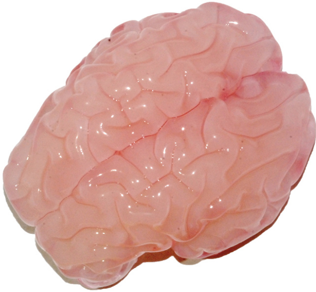
A gel model of a fetal brain after being immersed in liquid solvent. The resulting compression led to the formation of folds similar in size and shape to real brains.

The number, size, shape and position of neuronal cells during brain growth all lead to the expansion of the gray matter, known as the cortex, relative to the underlying white matter. This puts the cortex under compression, leading to a mechanical instability that causes it to crease locally.