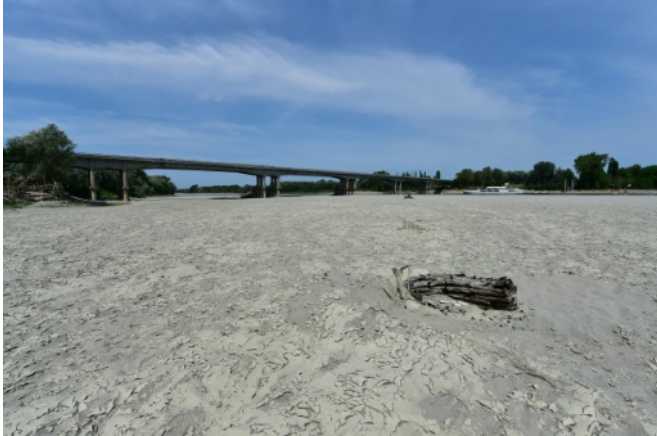
A picture taken on July 26, 2015, near Boretto, shows the dry river bed of the Po during a drought in Italy

US scientists on Wednesday confirmed that 2015 was the hottest year in the hottest decade on record, and by the widest margin yet. Will the records keep tumbling?