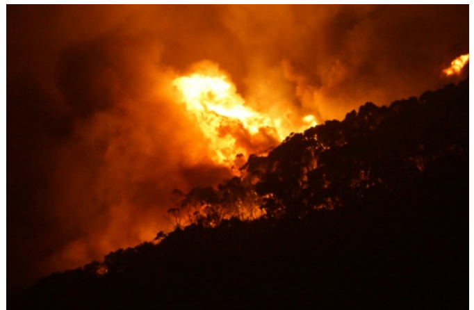
Wildfires in Australia fanned by hot, dry conditions engulfed more than 100 homes outside Melbourne in early December 2015

Scientists reported last week that climate change has probably pushed back the next Ice Age by 50,000 years.