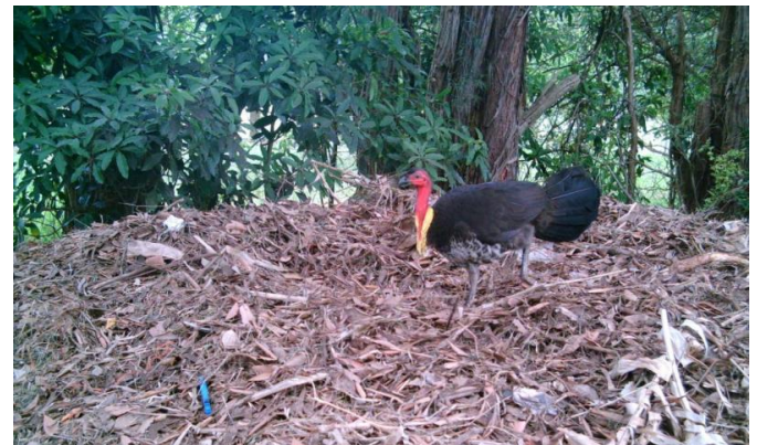
A typical brush turkey on its mound.

In Australia, the brush turkey (above) is well known in eastern regions for its nuisance value in gardens. In the more arid interior, the malleefowl is another member of this group. Both are among Australia's largest birds at between two and two-and-a-half kilograms in weight.