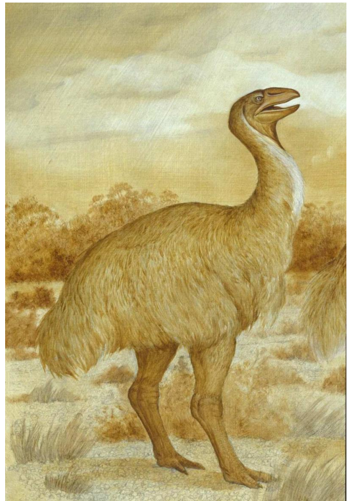
An artist's impression of Genyornis newtoni.

But simultaneously, across the breadth of Australia, Genyornis shell suddenly disappeared from the record between 50,000 and 45,000 years ago, while emu shell persisted in the record to the present.