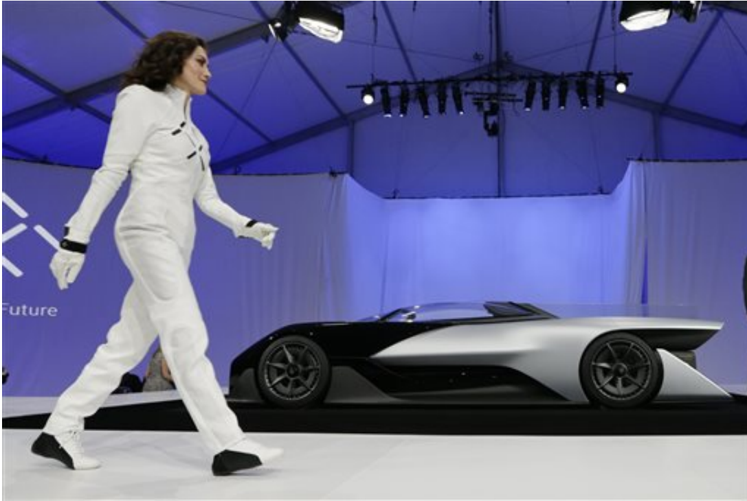
A driver walks in front of the FFZero1 by Faraday Future at CES Unveiled, a media preview event for CES International Monday, Jan. 4, 2016, in Las Vegas. The high-performance electric concept car was unveiled during a news conference by Faraday Future.