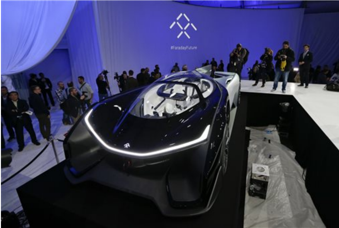
The FFZero1 by Faraday Future is displayed at CES Unveiled, a media preview event for CES International Monday, Jan. 4, 2016, in Las Vegas. The high-performance electric concept car was unveiled during a news conference by Faraday Future.