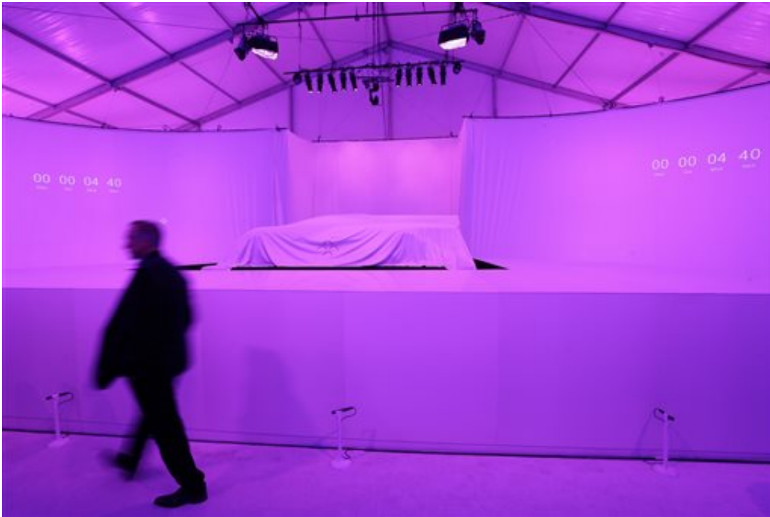
A man passes by the FFZero1 by Faraday Future, still covered, before it is displayed at CES Unveiled, a media preview event for CES International Monday, Jan. 4, 2016, in Las Vegas. The high-performance electric concept car was unveiled during a news conference by Faraday Future.