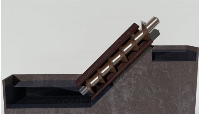
Figure 1: Archimedes screw. Continuous rotation of the screw pumps water from the lower-lying reservoir into the upper one.

The transport of particles is usually induced by applying an external gradient to a system. Water, for example, flows down a slope and electric current is generated by applying a voltage. But already in ancient times another way of generating a directional motion was known: by periodic modulation of a system, as can be seen in the famous Archimedes' screw. More than 30 years ago, the Scottish physicist David Thouless predicted that a similar phenomenon should also occur in quantum mechanical systems, so called topological pumping. A group of researchers from the Ludwig-Maximilians-Universität München and the Max Planck Institute of Quantum Optics, led by Professor Immanuel Bloch and in collaboration with the theoretical physicist Oded Zeitler (ETH Zürich), have now successfully implemented such a topological charge pump with ultracold atoms in an optical lattice for the first time.