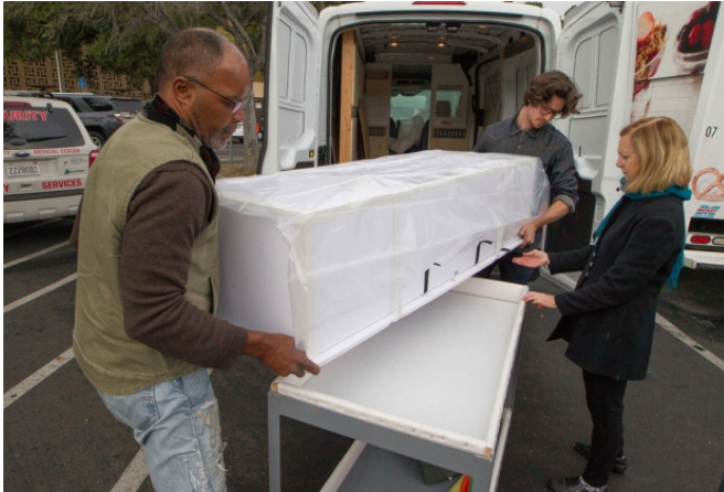
A 3,200-year-old Egyptian mummy arrives Nov. 24 at the School of Medicine to undergo a CT scan.