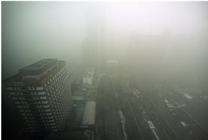
Fog and heavy pollution shroud a neighborhood in Beijing, Tuesday, Dec. 1, 2015. Schools in Beijing were ordered to keep students indoors Tuesday after record-breaking air pollution in the Chinese capital soared to up to 35 times the safety levels.

conditions were forecast to improve by Wednesday.