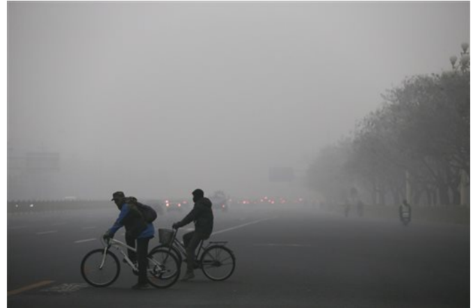
Cyclists wearing mask to protect themselves wait at a traffic lights junction on a heavily polluted day in Beijing, Tuesday, Dec. 1, 2015. Schools in Beijing were ordered to keep students indoors Tuesday after record-breaking air pollution in the Chinese capital soared to up to 35 times the safety levels.

Beijing schools were ordered to stop outdoor activities. A primary school in the Xicheng district on the west side sent a message to parents that classes were canceled Tuesday.