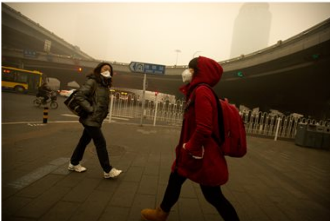
This combination of photos taken Sunday, Nov. 1, 2015, top, and Tuesday, Dec. 1, 2015, bottom, show pedestrians walking past an elevated highway in Beijing amid widely differing levels of air pollution. Schools in Beijing were ordered to keep students indoors Tuesday, Dec. 1, 2015 after record-breaking air pollution in the Chinese capital soared to up to 35 times safe levels.