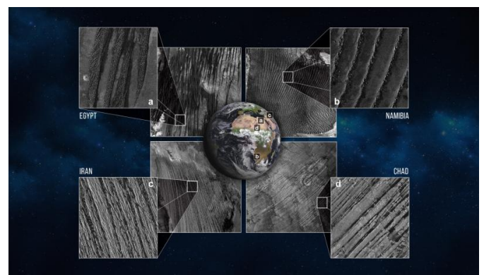
Sand dunes and mega-yardangs on Earth.

To get a better understanding, a team of scientists used a method known as comparative planetology. They studied radar images of features found here on Earth, taken by the Earth-orbiting TerraSAR-X satellite, to infer more about those on Titan.