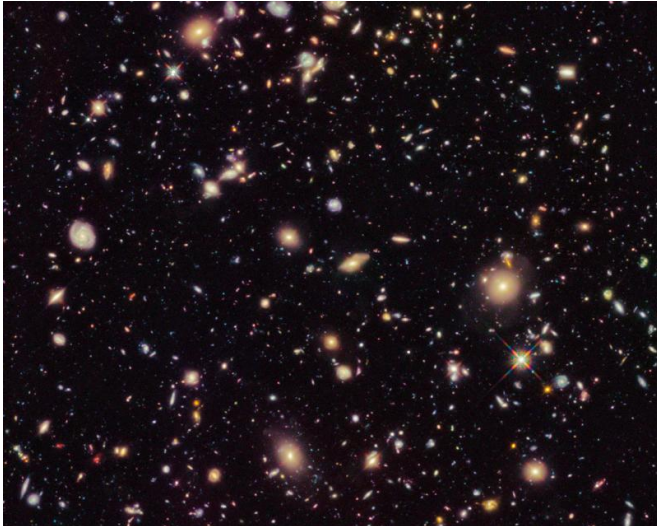
The space between the galaxies is expanding. How big is it?

So, how can galaxies be traveling faster than the speed of light when nothing can travel faster than light?