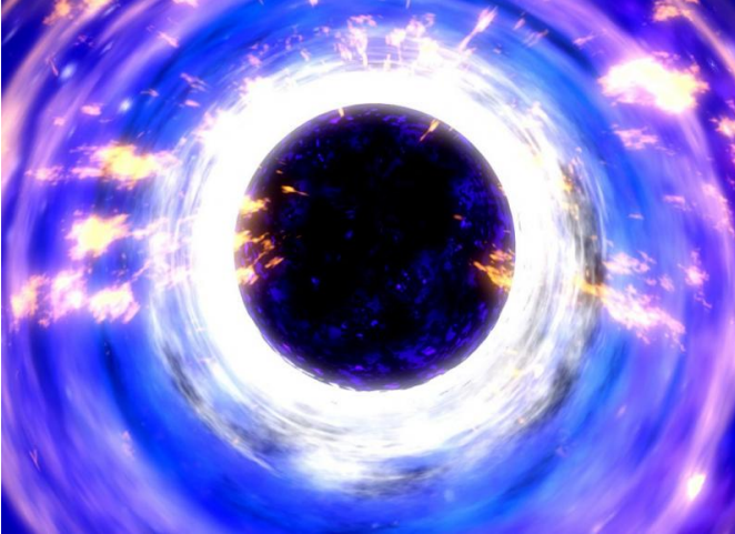
Artistic view of a radiating black hole.

In theory, a black hole singularity would compress down until the smallest possible size predicted by physics. Then it would rebound as a white hole. But because of the severe time dilation effect around a black hole, this event would take billions of years for even the lowest mass ones to finally get around to popping.