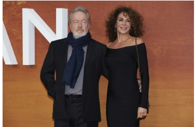
British filmmaker Ridley Scott (L) and his partner Costa Rican actress Giannina Facio pose for photographers as they arrive for the European premiere of "The Martian" in London's Leicester square on September 24, 2015