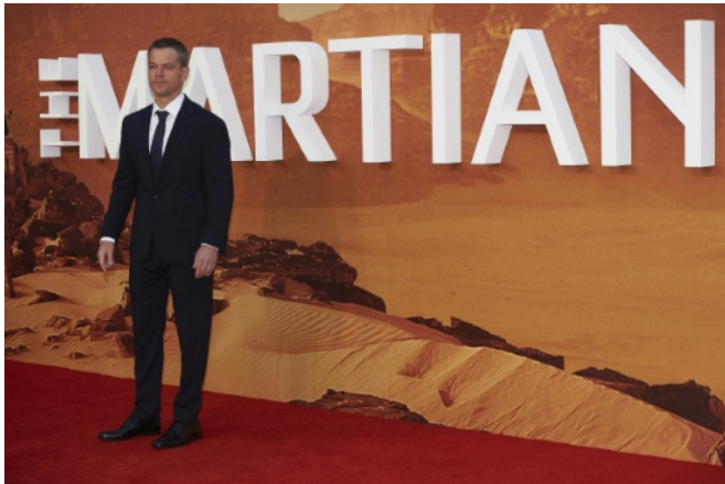
US actor Matt Damon arrives for the European premiere of "The Martian" in London's Leicester square on September 24, 2015

Surviving in space is hard and scientists say "The Martian" shows precisely what challenges astronauts will face on a pioneering mission to Mars, even though it contains some big inaccuracies right from the get-go.