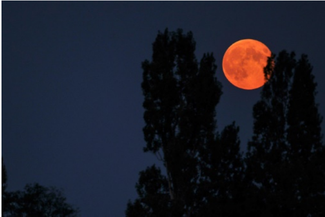
A 'supermoon' is seen from the central French city of Luynes, in September 2014

For the first time in decades, skygazers are in for the double spectacle Monday of a swollen "supermoon" bathed in the blood-red light of a total eclipse.