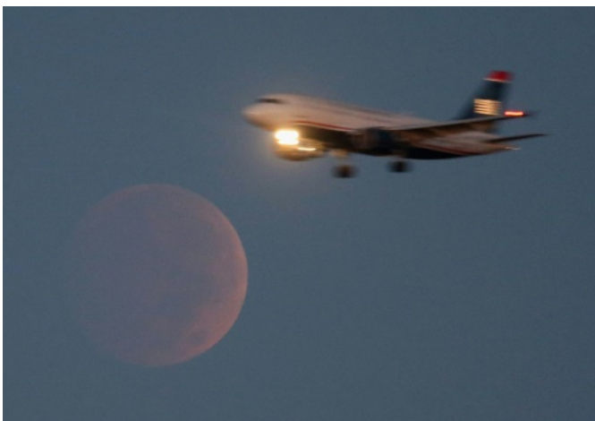
A commercial airliner approaches Reagan National Airport in Washington, DC, as it flies past the full moon during a lunar eclipse on October 8, 2014

Unlike a solar eclipse, which creates the impression of a bright 'ring' of light as the Moon passes before our star, there is no danger in watching lunar spectacle with the naked eye, experts say