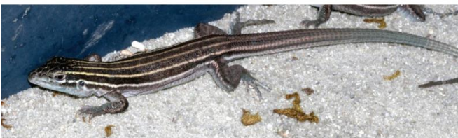
Adult lizards.

The chameleon's exceptional tree-climbing ability is dependent on vital ball-and-socket joints in its wrists and ankles, according to research published in the open access journal BMC Evolutionary Biology . The study also finds that chameleons have twice the number of wrist and ankle skeletal elements than previously thought, and explains how they evolved to live in the trees.