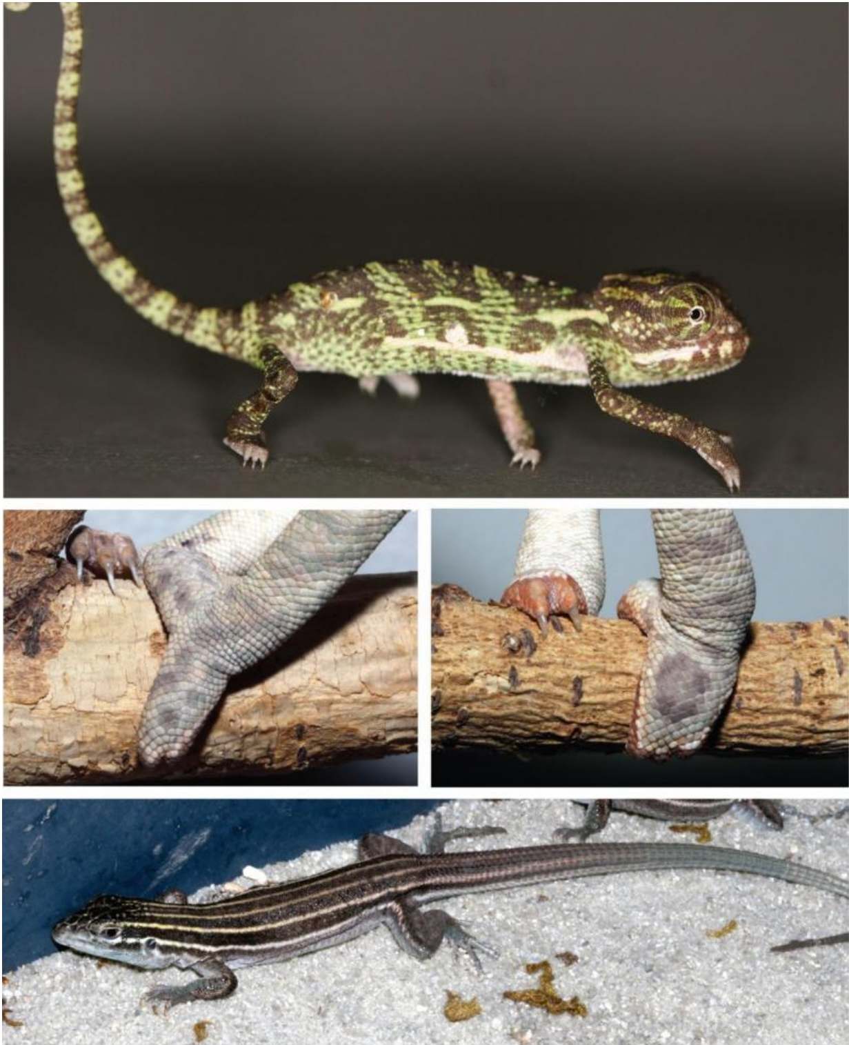
Adult lizards. Credit: Diaz and Trainor, BMC Evolutionary Biology 2015